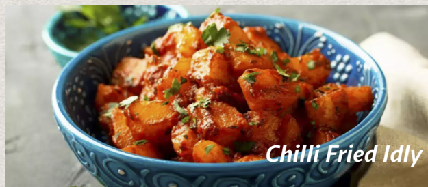
Chilli Fried Idly

Thick porridge from dry-roasted semolina (G)